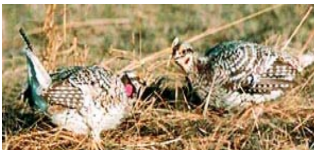
Photo of Sharp Tailed Grouse ( Tympanuchus phasianellus )

As a good land steward, it is important to be aware of plant and animal species of special concern that may occur on your lands, and how forest management activities may affect these species. The Washington State Implementation Committee (WA SIC) for the Sustainable Forestry Initiative (SFI) is pleased to provide a series of factsheets on species of special concern that may occur on forested lands within Washington State. Each species factsheet includes a description of the species, habitat, range, and information on known threats to populations in Washington.